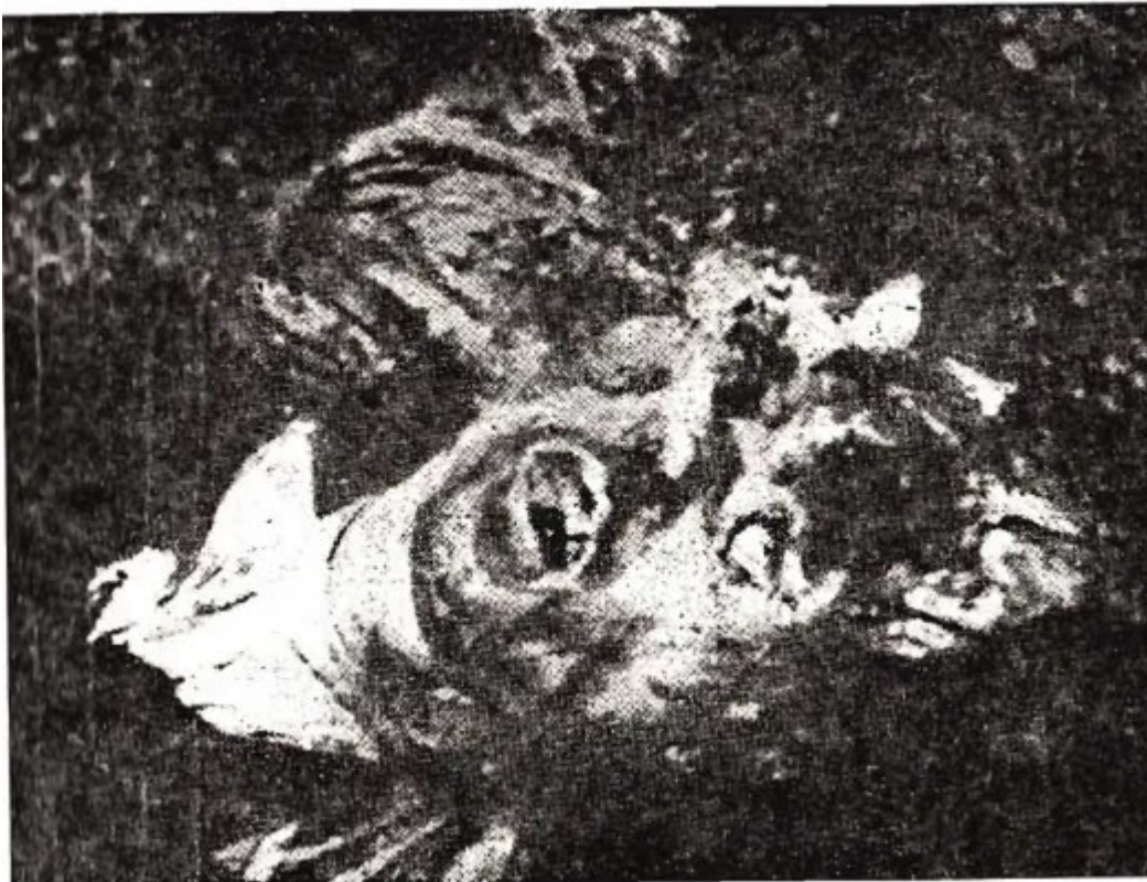
A Serbian victim of the Croats' Ustashi whose brain was extracted.

“For fully ten months now, however, the Serbs in Croatia are being exterminated in a most beastly manner, with billions of their property subjected to destruction, while the face of an honorable Croat blushes with shame and anger. Since the first day of the Independent Croatian State, the Serbs have been massacred (Gospich, Gudovac, Bos, Krajina, etc.) and this massacring has continued to this day.