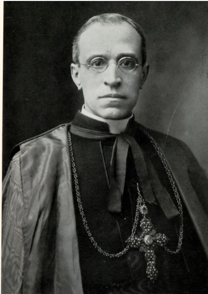
Cardinal Eugenio Pacelli, Secretary of State of the Vatican, who later became Pope Pius XII.