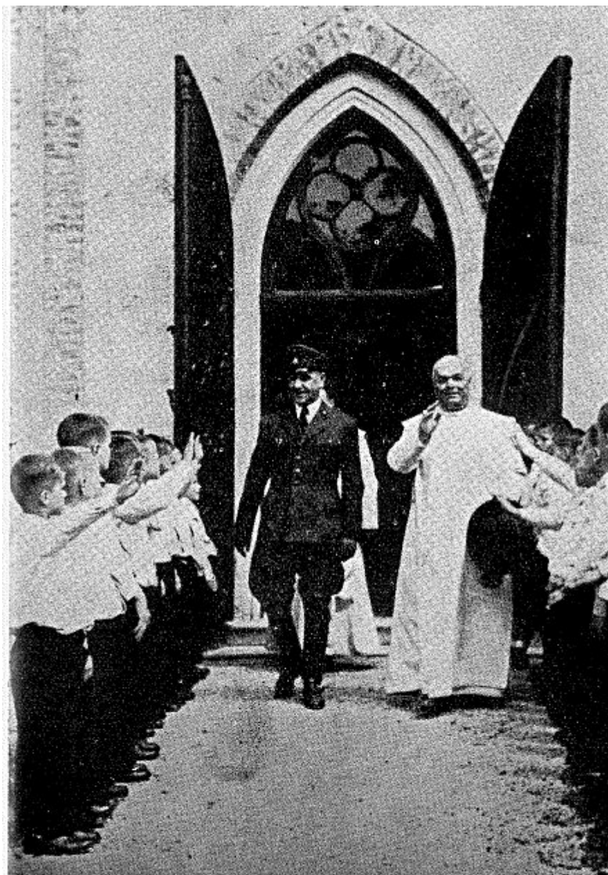
The pontifical legate Marcone and Pavelitch receive the Nazi Salute from a group of young Ustashe.