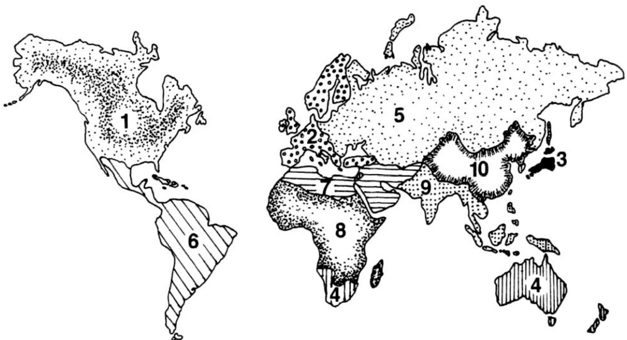
Ten Kingdoms . . . from: THE CLUB OF ROME

I believe these 10 regions may very well be the 10 horns / crowns of the books of Daniel and Revelation!