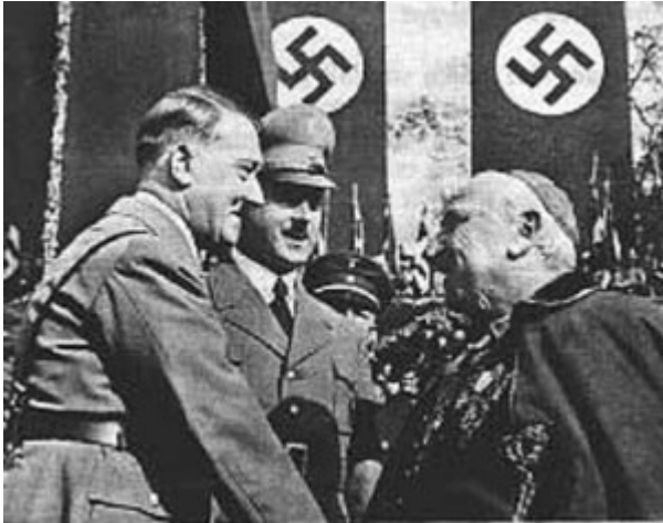
Hitler meets Pope Pius XII

I first posted this article on Aug. 26, 2009. Now because of Russia's invasion of Ukraine, I thought Christians might appreciate this message and stand against the spirit of war. The only justifiable war according to the Bible and in my opinion, is one of self-defense when an enemy attempts to invade one's nation.