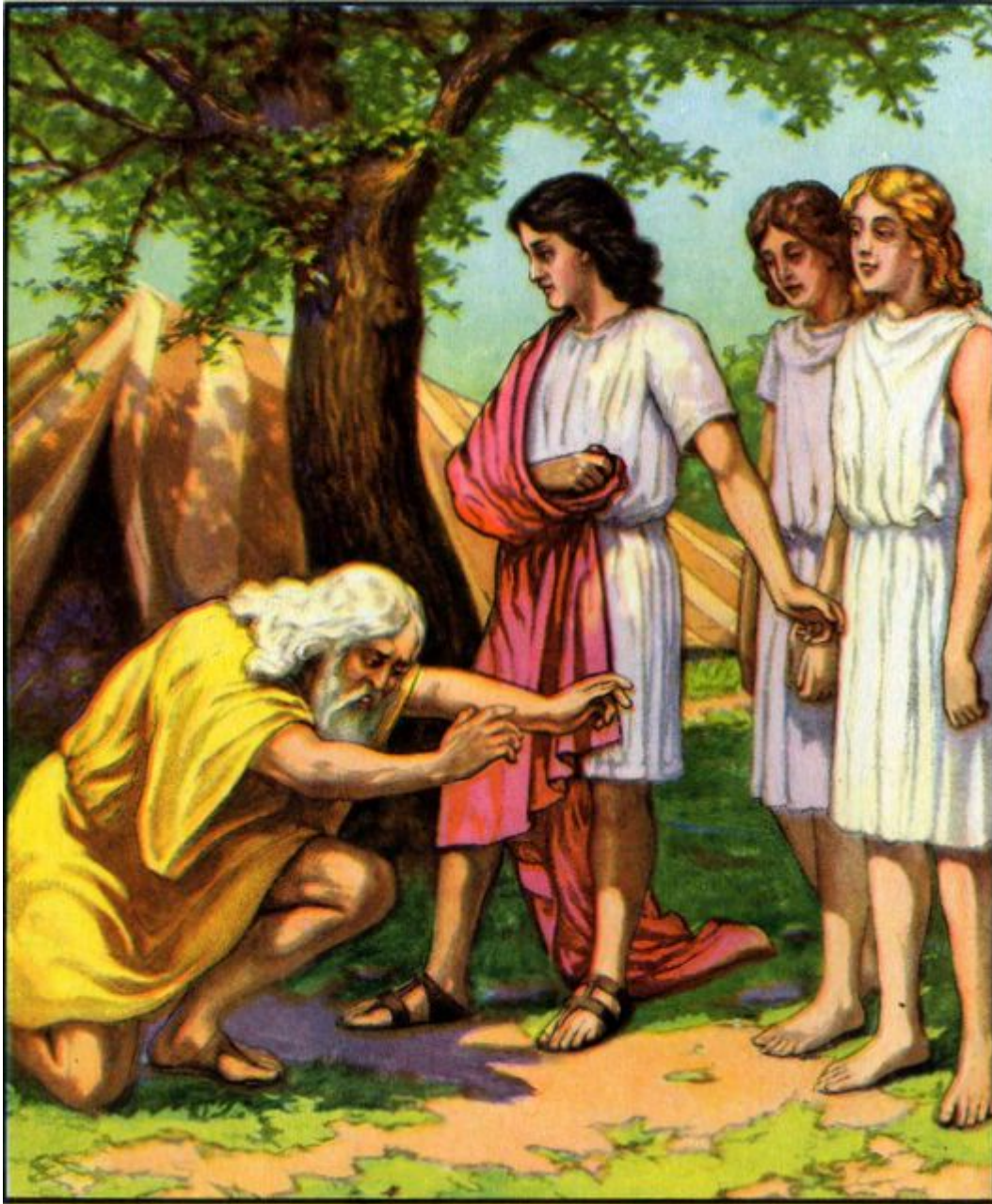
Abraham Entertains Strangers Genesis 18:2

Genesis 18:1 ¶And the LORD appeared unto him (Abraham) in the plains of Mamre: and he sat in the tent door in the heat of the day; 2 And he lift up his eyes and looked, and, lo, three men stood by him: and when he saw them, he ran to meet them from the tent door, and bowed himself toward the ground,