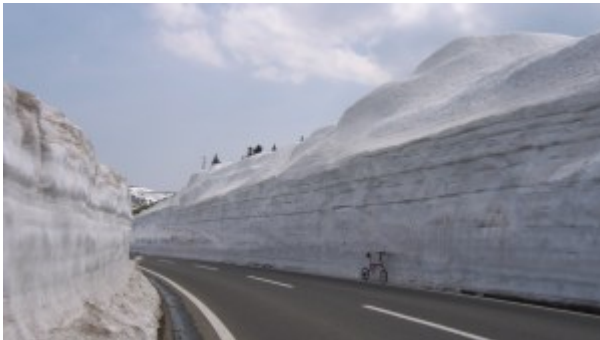
Walls of snow along road in Japan

February 1, 2011: I started out very well with the first ride on my trip to Noda city in Chiba prefecture, just east of Tokyo. The purpose of this trip was to attend a fellowship meeting at 7 PM. It was good weather and I left home at a very good time, just after 10 AM. Tokyo is 300 kilometers away but it usually takes me less than 6 hours, only half a day. I found that weekends are best for hitchhiking, but today was a weekday, a Tuesday. I finally arrived in Noda at 8:25 PM!