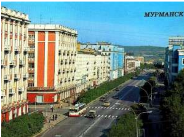
This is the main street of the town that runs past the train station. There's a large statue of Lenin still standing in a small park on this street.