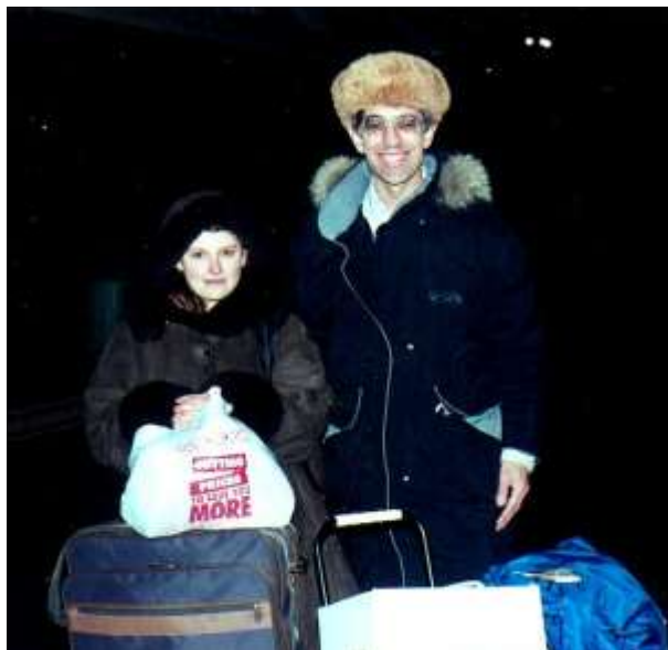
With Ukrainian Faithy just before boarding a train to go to Murmansk. It's a 36-hour train trip one way from St. Petersburg. I've been back and forth exactly 10 times which means I lived 25 days on that train!