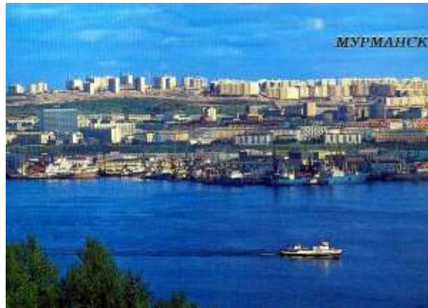
Murmansk in the summertime! The body of water in front is the Kolsky bay. Lenin Street, Murmansk.