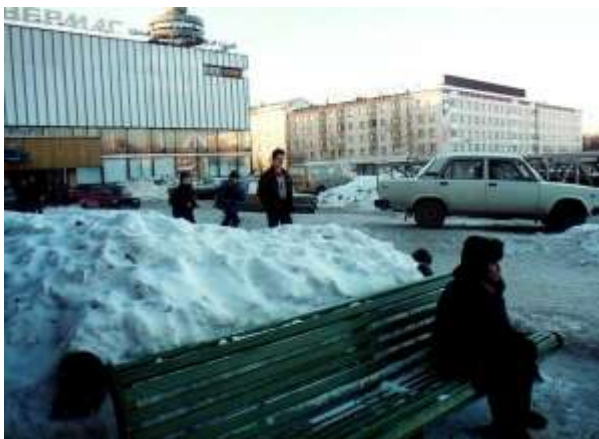
What Murmansk usually looks like! Cold, drab, and dreary.