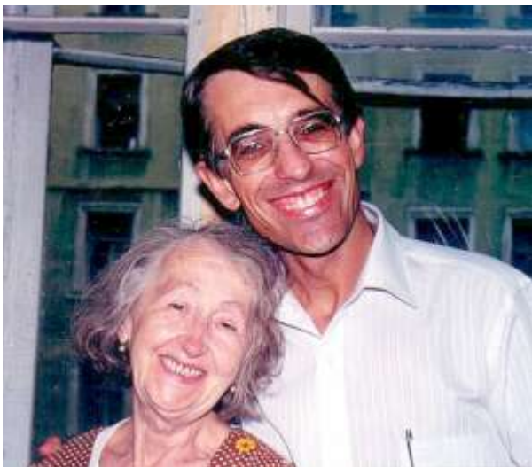
How life changed for the average Russian after the fall of the Soviet Union.