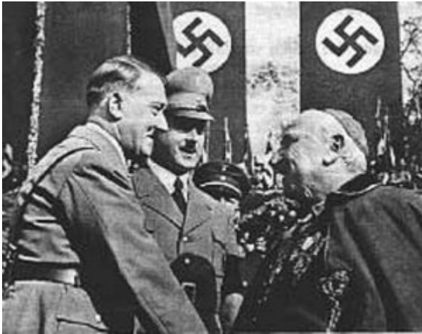
The Pope meets Hitler