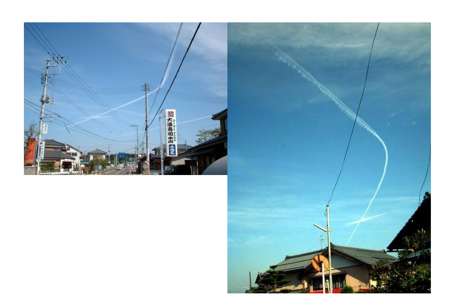
Information about Chemtrails

Photos taken on June 7, 2005 from 7:39PM to 7:44PM