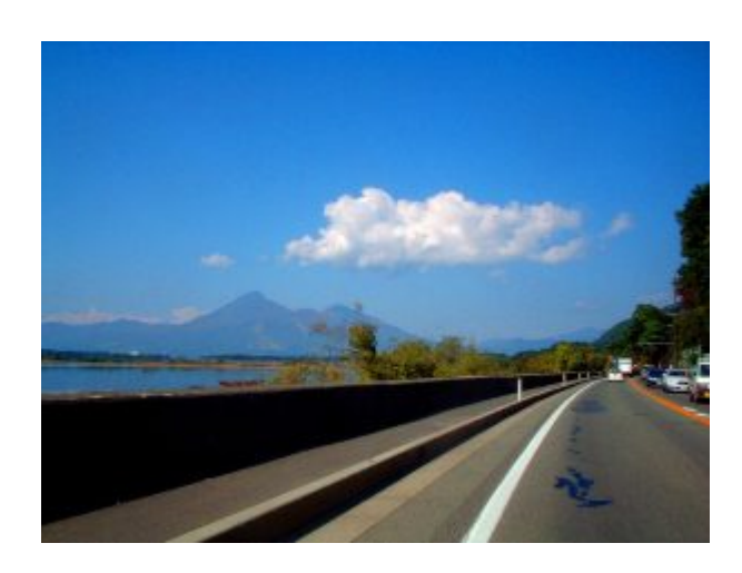
Route 49 by Lake Inawashiro, Fukushima Prefecture

October 14, 2009: Today I went to Sendai via the same route I took on my adventure to Aomori via Fukushima on Sept. 17, 2009. I thought it would be a piece of cake considering that Sendai is only 290 kilometers or a bit less than half the distance to Aomori. This time, however, I got stuck at Aizuwakamatsu City in Fukushima for nearly a couple of hours both going to Sendai and on the way back home. In spite of that, the wonderful people I met along the way made it all worthwhile.