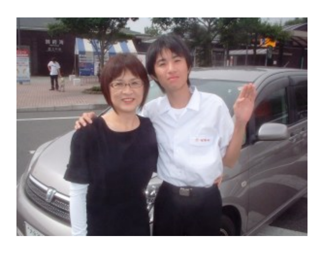
August 8: It was fine weather, a Saturday and close to the beginning of the