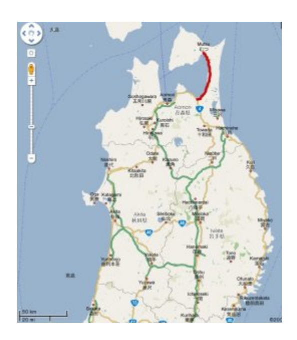
Northern Honshu, Japan

October 11, 2009: I was in Mutsu City in the Shimokita peninsula in Aomori prefecture of northern Japan. As you can see on the map, the top of the red line was my starting point and the end of the line is Noheji city which was my destination. I started out 11:30AM and had to be at Noheji city by 2PM in order to catch a train to Hirosaki City in order to be there by 4:30 at the latest so I could catch a ride with a friend back to Niigata. My friend said he couldn't wait for me very long, and I certainly didn't want to inconvenience him. There is a train line running from Mutsu City but it didn't leave till after 2PM which meant I would miss the train from Noheji if I took it. My only recourse was to hitchhike along the country road that runs along the eastern coast of the Rikuoka Bay.