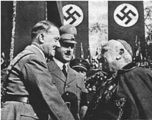
Hitler meets Pope Pius XII

I first posted this article on Aug. 26, 2009. Now because of Russia's invasion of Ukraine, I thought Christians might appreciate this message and stand against the spirit of war. The only justifiable war according to the Bible and in my opinion, is one of self-defense when an enemy attempts to invade one's nation.