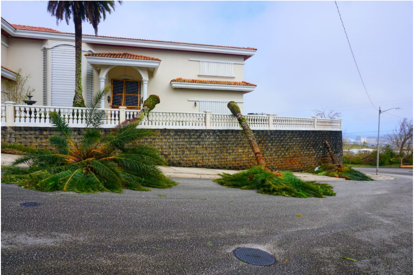
Uprooted palm trees