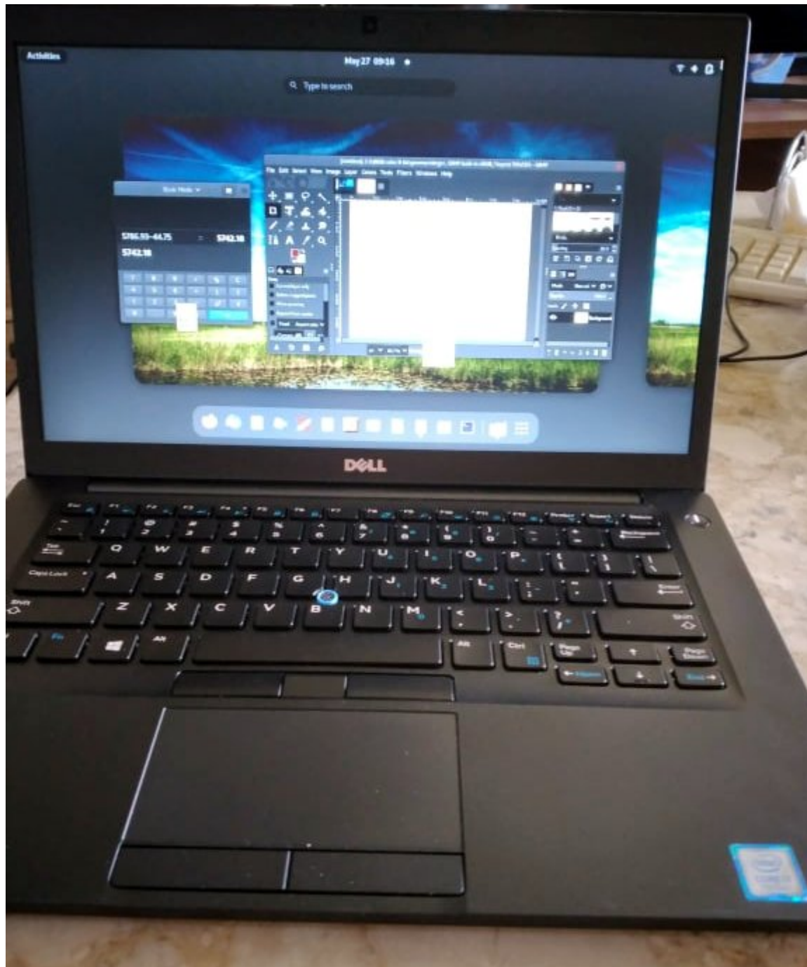
My Dell Latitude 7480 with Fedora 34 Workstation and Gnome 4.0 Desktop