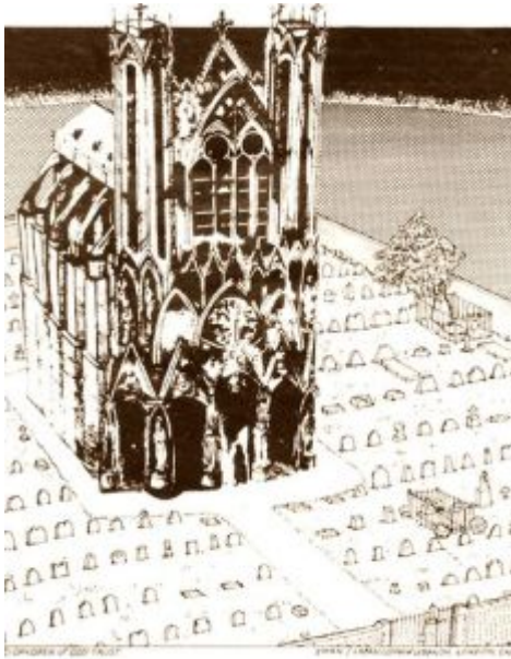
The false church

This article is a re-post from https://www.jimsearcy.com/ChurchHistory.htm .