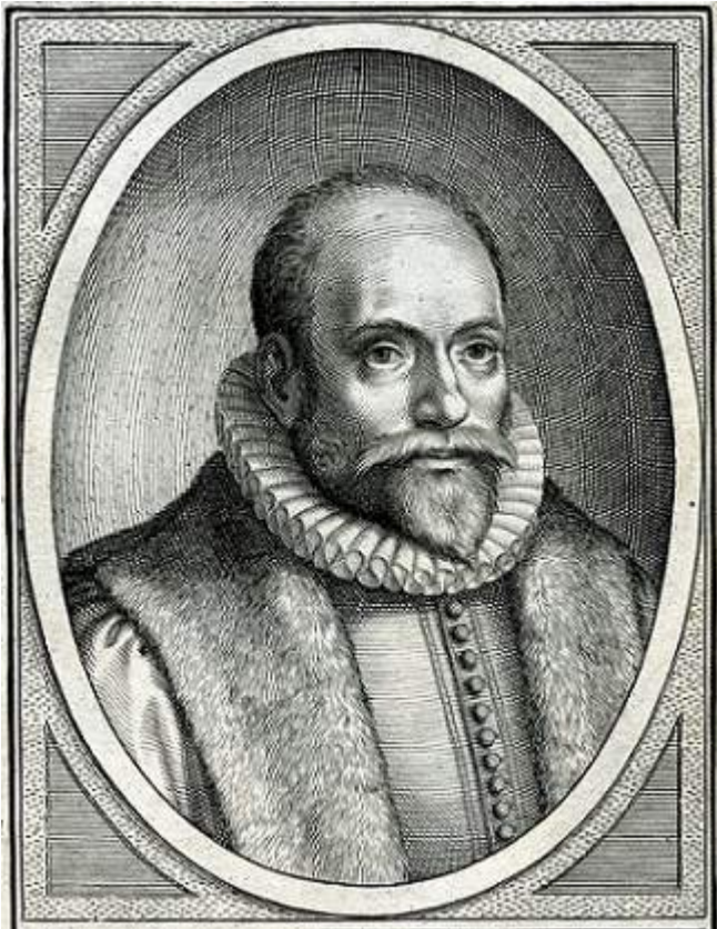
James (Jacob) Arminius

of Arminianism. He was educated at the new Dutch University at Leyden and then at Geneva under the tutelage of Theodore Beza, Calvin's well respected follower and successor. Around 1591, after only a year at the Geneva Academy, he began to develop views that were to become diametrically opposed to the doctrines of free and sovereign grace that were taught at Geneva. He departed and continued his education elsewhere. He became a minister in Amsterdam and was later invited to become Professor of Divinity at the University of Leyden. It was from this point that he began propounding his theories with (guarded) vigour.