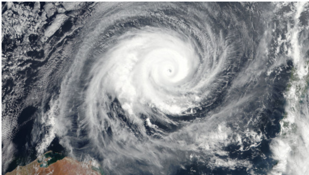
A cyclone in the Southern Hemisphere

When I lived in Japan, I met a young man from Australia who told me one of the first things he did after arriving at the Tokyo International Airport, was to go to a restroom to see if the water in a sink would flow down the drain in a clockwise direction. It did of course. He was used to seeing water drain down the sink in a counterclockwise direction in Australia. Both Australia and Japan are thousands of kilometers from the equator. The cool thing about this experiment in Uganda is it was done only a few meters , only 10 meters or so, north and south of the equator.