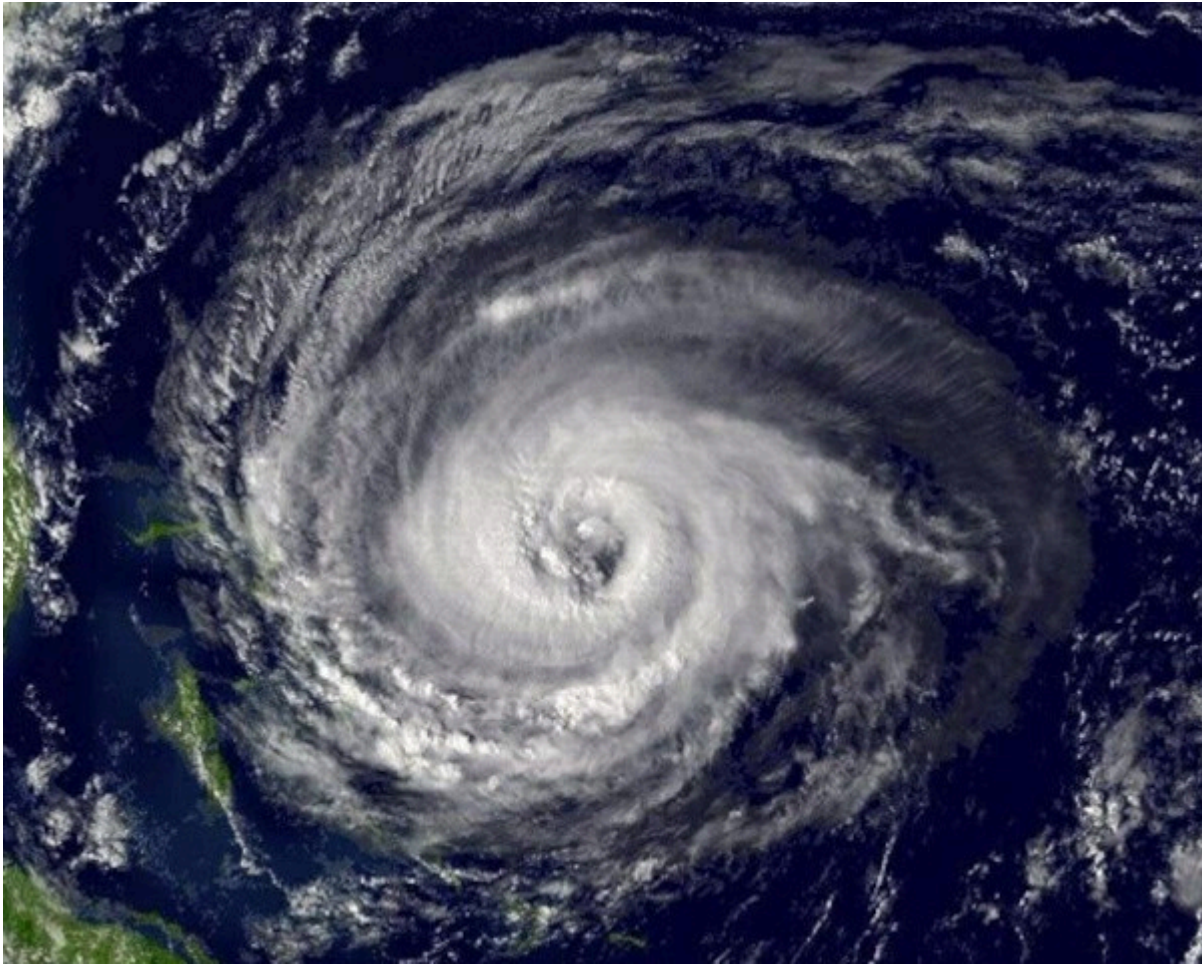
A hurricane in the Northern Atlantic.