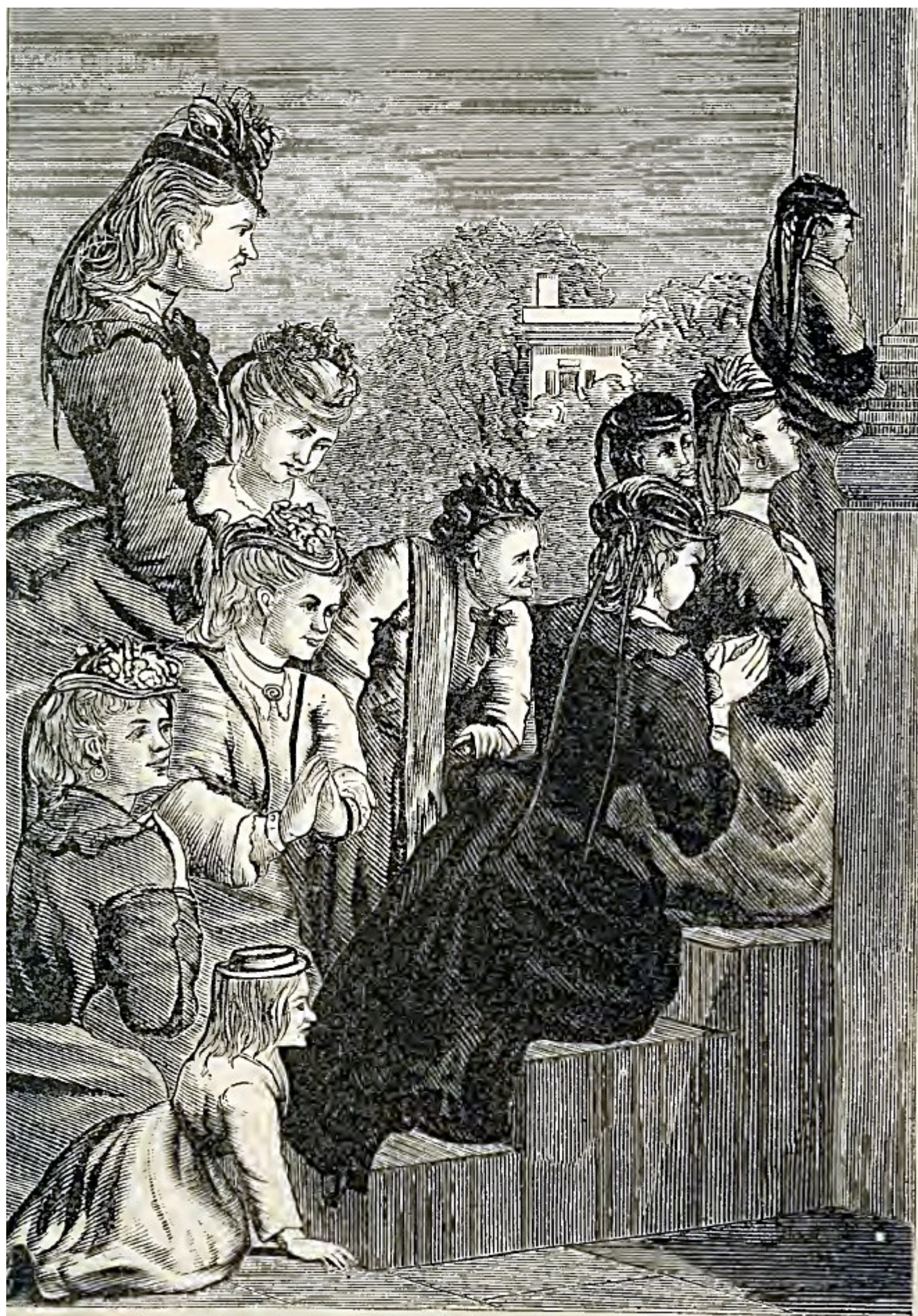
WOMEN CREEPING INTO CHURCH.