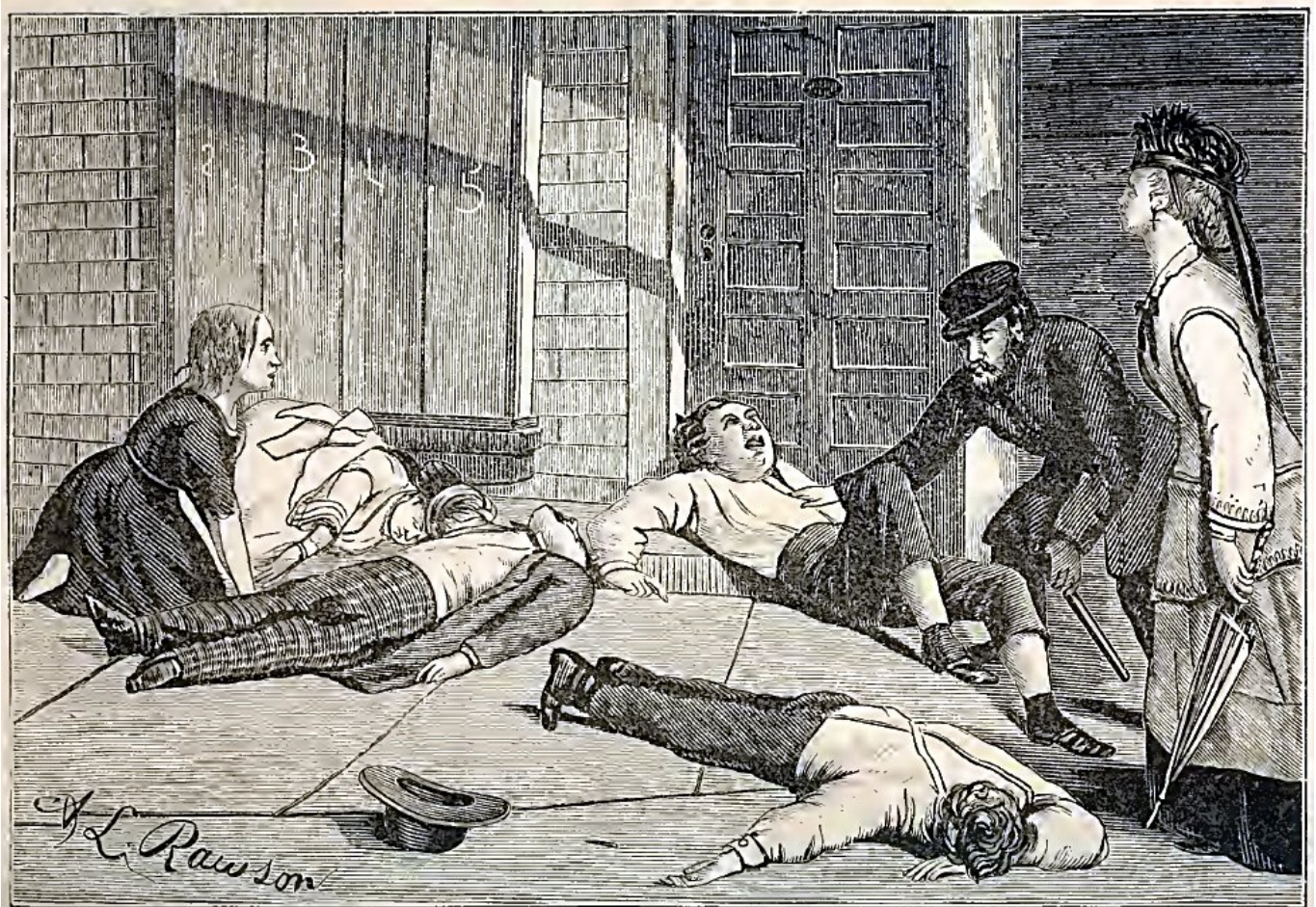
NEW YORK RIOT, 1871.

Catholics are strangely consistent friends of liberty, if we may judge from the riots in New York, July 12th, 1870, the anniversary of the Battle of the Boyne, when unoffending Orangemen peacefully celebrating the day commemorative of the victory of William of Orange over James II, and the consequent ascendancy of the Protestant religion, were attacked; some killed and many wounded. And the Catholic papers of the city—where for many long years Catholics have been permitted uninterruptedly to form processions on Sundays, and to celebrate St. Patrick's and other days, blocking up the streets, excluding Protestants from their own sanctuaries, and making every demonstration calculated to exasperate them—argue, with surprising unanimity, that "this miserable faction ought not to be allowed to madden this nation by their annual celebration." Have Protestants no rights which Catholics need respect?