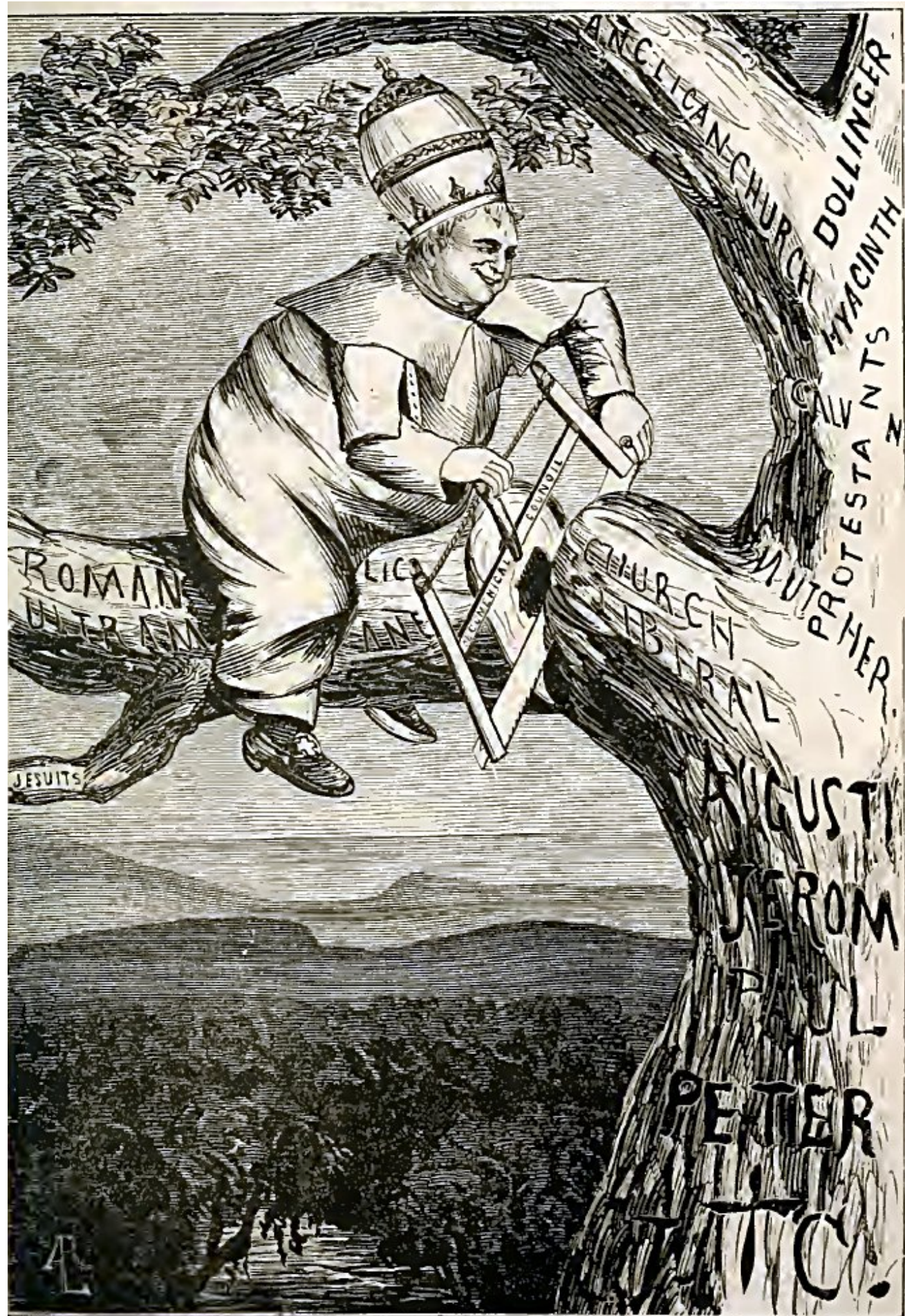
THE INFALLIBLE POPE.