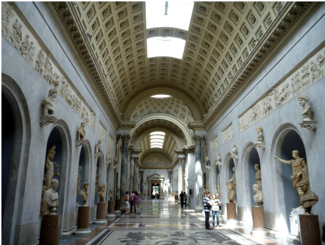
Inside the Vatican

Cardinal Newman recorded for posterity his insight into the way in which the true teaching of Christ was covered over with the paganism of old Rome by the Roman Catholic church. In one of his Tracts for the Times , written in 1883, he declared: