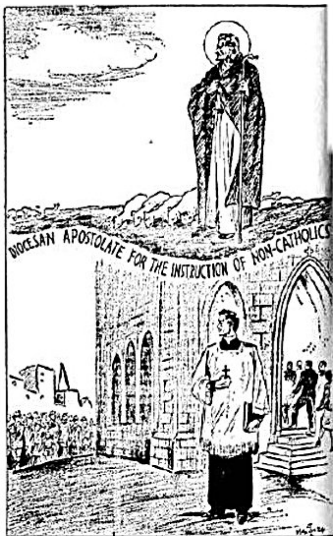
Above picture, from the Catholic Brooklyn 'Tablot,' of November 3, 1913, falsely shows the priest as 'Alter Christus,' 'Another Christ.'

torial power of the church of Rome in both religious and political affairs, as we see it today, will be explained in a second article in next month's issue.) [Included below -Ed]