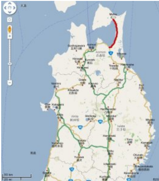
Northern Honshu, Japan

October 11, 2009: I was in Mutsu City in the Shimokita peninsula in Aomori prefecture of northern Japan. As you can see on the map, the top of the red line was my starting point and the end of the line is Noheji city which was my destination. I started out 11:30AM and had to be at Noheji city by 2PM in order to catch a train to Hirosaki City in order to be there by 4:30 at the latest so I could catch a ride with a friend back to Niigata. My friend said he couldn't wait for me very long, and I certainly didn't want to inconvenience him. There is a train line running from Mutsu City but it didn't leave till after 2PM which meant I would miss the train from Noheji if I took it. My only recourse was to hitchhike along the country road that runs along the eastern coast of the Rikuoka Bay.