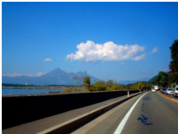
Route 49 by Lake Inawashiro, Fukushima Prefecture

October 14, 2009: Today I went to Sendai via the same route I took on my adventure to Aomori via Fukushima on Sept. 17, 2009 . I thought it would be a piece of cake considering that Sendai is only 290 kilometers or a bit less than half the distance to Aomori. This time, however, I got stuck at Aizuwakamatsu City in Fukushima for nearly a couple of hours both going to Sendai and on the way back home. In spite of that, the wonderful people I met along the way made it all worthwhile.