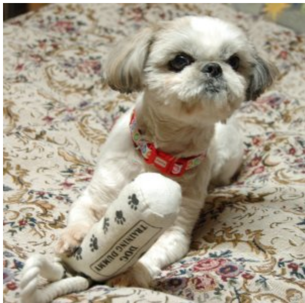
Princess with her toy