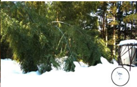
Princess in snow