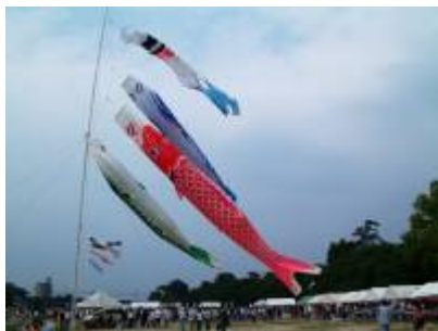
The flags in the shape of Japanese carp are called Koinobori in Japanese. They are flown every year from April till the end of Golden Week.