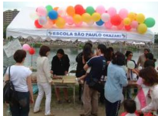
Booth of the Brazilian school in Okazaki, Aichi Prefecture.

"Koinobori. Carp streamers, called koinobori in Japanese, decorate the landscape from April through early May in honor of Children's Day on May 5. In Japanese culture, the carp symbolizes courage and strength because of its ability to swim up a waterfall. Since these are traits desired in boys, families traditionally flew koinobori from their homes to honor their sons. Ranging in size from about a foot to several meters in length, the koinobori resemble jewel-toned sea beasts swimming through the watery, azure skies. May, 1998." (Taken from http://www.hardfocus.net/stevie/koinobori.htm )