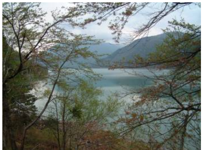
One of the many lakes along the way