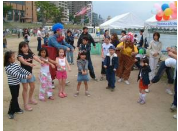
Brazilian children dancing