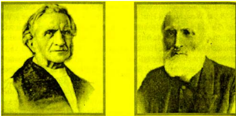
Bruce Foss Westcott and Fenton John Anthony Hort

Professor Westcott wrote to the Archbishop of Canterbury, "It does not seem to me that the Vaudois [the Waldensians] claim an ecclesiastical recognition. The position of the small Protestant bodies on the Continent is no doubt one of great difficulty. But our church can, I think, only deal with churches growing to fuller life." Hort wrote to Westcott, on September 23, 1864, "I believe Coleridge [Samuel Taylor Coleridge, the poet https://www.jamesjpn.net/wp-admin/post-new.php ] was quite right in saying that Christianity without a substantial church is vanity and disillusion; and I remember shocking you and Lightfoot not so long ago by expressing a belief that 'Protestantism' is only parenthetical and temporary." Hort harboured a lifetime hatred of the Received Text, which as early as 1851 he described as "vile, leaning on late manuscripts" and "villainous".