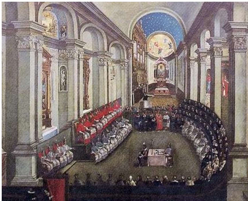
The Council of Trent in the Santa Maria Maggiore church; Museo Diocesano Tridentino, Trento.