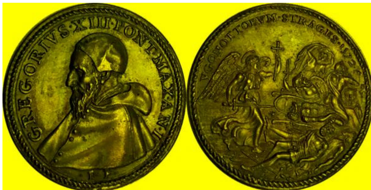
Obverse and Reverse of the St. Bartholomew Medal. PAPAL ROME Offering French Protestants the alternative of the CRUCIFIX or the SWORD.

this dispensation. This prophecy implies that she has daughter churches also, such as the High Church of both England and Scotland, the clergy of which celebrate Mass, hear confessions, burn incense, creep to and adore the cross. offer up prayers for the dead, and conduct their services arrayed in the millinery, robes and colors of Rome. Most of Rome's "converts" come from these churches after having first tampered with her Babylonish practices, ritual, ceremonies, and wine, and thus first been made drunk , or in other words, robbed of their sober senses, and made incapable of distinguishing between truth and error. This explains why otherwise well balanced and scholarly men are ensnared at times by this "Church;" as the Scriptures affirm, she makes them drunk . This is no mere empty figure of speech. What other condition of heart or mind could lead intelligent and even scholarly men to believe and propagate so vehemently the doctrine of the pretended Real Presence of Christ in the bread and wine after so called consecration? The secret of it all is, that there is a mighty deceiving satanic spirit behind this doctrine which drowns the reason. This explains why men are so mightily gripped by this strange idolatrous doctrine.