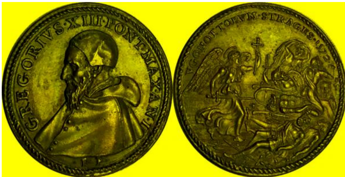
Obverse and Reverse of the St. Bartholomew Medal. PAPAL ROME Offering French Protestants the alternative of the CRUCIFIX or the SWORD.

this dispensation. This prophecy implies that she has daughter churches also, such as the High Church of both England and Scotland, the clergy of which celebrate Mass, hear confessions, burn incense, creep to and adore the cross. offer up prayers for the dead, and conduct their services arrayed in the millinery, robes and colors of Rome. Most of Rome's "converts" come from these churches after having first tampered with her Babylonish practices, ritual, ceremonies, and wine, and thus first been made drunk , or in other words, robbed of their sober senses, and made incapable of distinguishing between truth and error. This explains why otherwise well balanced and scholarly men are ensnared at times by this "Church;" as the Scriptures affirm, she makes them drunk . This is no mere empty figure of speech. What other condition of heart or mind could lead intelligent and even scholarly men to believe and propagate so vehemently the doctrine of the pretended Real Presence of Christ in the bread and wine after so called consecration? The secret of it all is, that there is a mighty deceiving satanic spirit behind this doctrine which drowns the reason. This explains why men are so mightily gripped by this strange idolatrous doctrine.