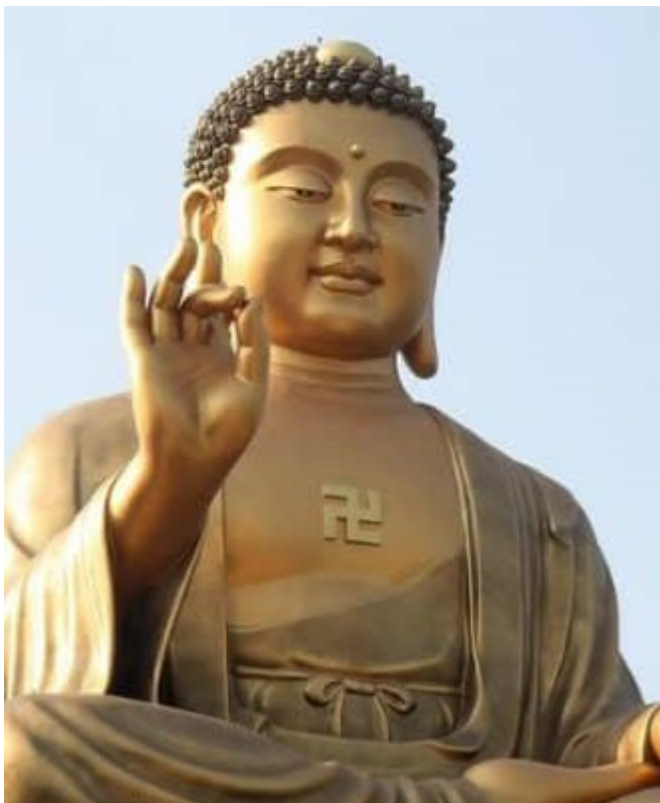
Swastika on a statue of Buddha.

Now let's talk about the right wing. You say well, what's the symbol of Fascism? The symbol of Fascism is the Swastika. No. Actually, if you study what the Swastika is, it was an ancient sort of an Indian Hindu type of a symbol for good luck , essentially. That's all it is.