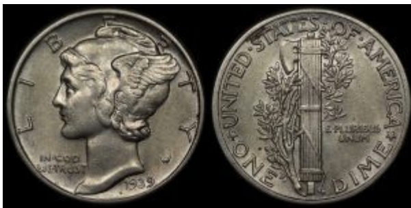
Old Mercury dime. 10 cents or $0.10 USD.

And you say, "Well I think I've seen that before!" Well if you look at an old mercury dime here in America it was on the back of the mercury dime, a Roman Fasces.