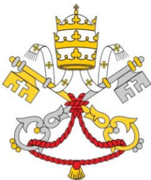
Emblem of the Holy See – the temporal power of the Roman Catholic Church

They have been using this system for centuries. It’s very important to understand this. And again if you study anything about Catholicism they teach that they have spiritual and temporal power symbolized by two swords. They also have two keys which they get into the thing of the keys of death and hell and heaven and whatever else, but they believe that the Pope in Rome believes he has power over all religion and also over all governments spiritual and temporal.