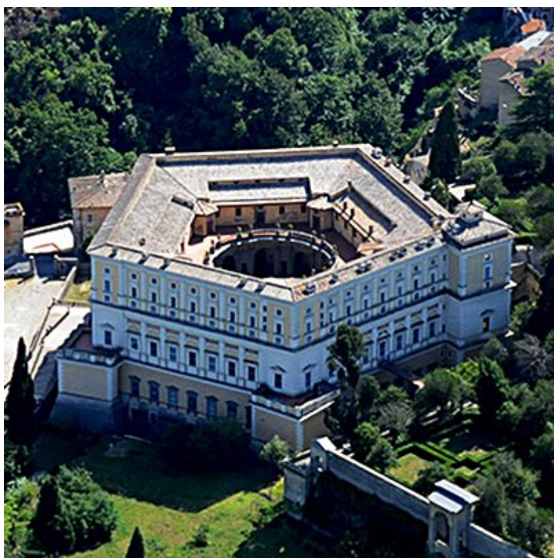
The Villa Farnese.

Google was founded on the date of the consecration of the Jesuit order, September 27 . A Farnese (an influential family in Renaissance Italy) who's not Jewish, Pope Paul III, consecrated the Jesuits on September 27 1540 . By coincidence, Jim, that is the birthday of Google! So when you look up Farnese, or, you know, the fact that Farnese Villa looks exactly like the Pentagon, the fact that the Pentagon the first stone was laying on September 11, 1941, just two months before three months before the false flag of Pearl Harbor, none of that stuff is readily available.