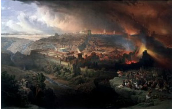
The siege and destruction of Jerusalem by Rome in 70 A.D.

I've covered in other articles how the Olivet Discourse in Matthew 24 has been falsely interpreted to be an End-time event by most evangelicals today. However, because I kept hearing false interpretations about it from people close to me, I felt the need to write something short and thought-provoking to try to lead my fellow brothers and sisters to a deeper and correct understanding of what Jesus was saying to His disciples. I hope to convince you from the Scriptures alone that the Great Tribulation He spoke of in Matthew 24 is NOT an End-time event.