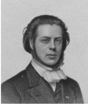
Henry Grattan Guinness – (11 August 1835 – 21 June 1910), an Irish Protestant Christian preacher, evangelist and author.

THE lofty decree of Papal Infallibility issued by the Vatican Council of 1870, immediately followed by the sudden and final fall of the Papal Temporal Power, after a duration of more than a thousand years, was the primary occasion of my writing that series of works on the fulfilment of Scripture prophecy which has appeared during the last quarter of a century.