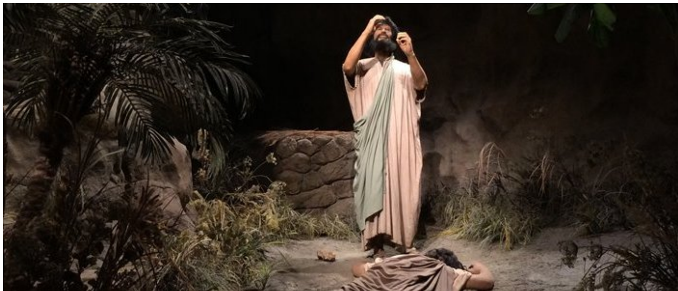
God speaking to Cain.

Abel! Cain was the firstborn and he was Abel's superior. Cain had the birthright, not Abel. But in spite of the Lord's encouragement to him, his envy of his younger brother still got the best of him and he killed him. In spite of the fact the Lord tried to lift up Cain's spirit so he wouldn't sin, Cain's pride and jealousy caused him to sin anyway! So sad!