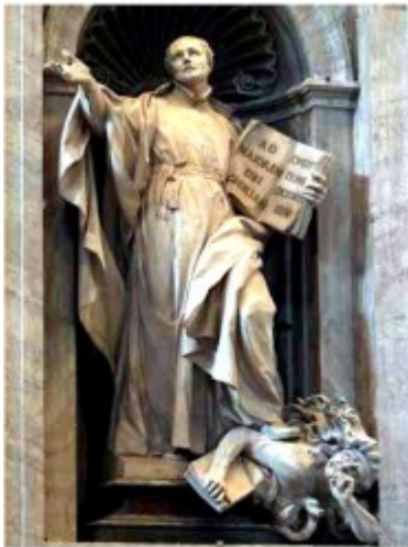
Statue in St. Peter's Basilica of Ignatius of Loyola, the founder of the Jesuit Order. His foot is on a Protestant Christian holding a Bible.