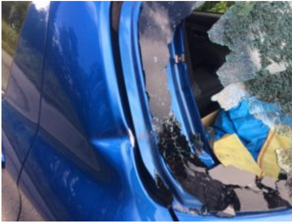
Closeup of rear window.