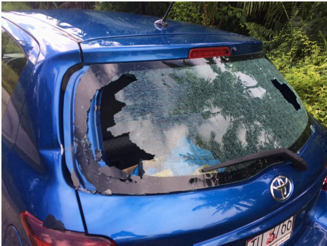
Rear window of my Toyota Yaris after the baseball bat attack.

On June 20th, 2019, just after I took my father-in-law to his home in Piga Subdivision from the Dededo Senior Citizen's Center on the island of Guam, after turning right onto the main road of Chalan Koda, I saw a car ahead that was stopped about 50 meters from the intersection. I drove around the car on its left and then saw a man standing in the middle of the road holding a baseball bat. As I drove slowly past the man, he violently swung his baseball bat and smashed the rear window of my Toyota Yaris! Imagine my shock! This is the stuff of nightmares! I found out later that the driver of the car I went around had stopped and even backed up because the man with the baseball bat was throwing rocks at him!