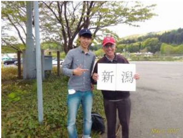
Chart of 10 years of Hitchhiking

The chart shows how many kilometers I hitchhiked every year for the last 10 years. Only the first year of 2005 doesn't show accurately how far I hitchhiked that year for I started keeping records from August 2, 2005. The total distance to date is 223,042 kilometers. over a period of exactly 925 days in 3587 vehicles. The latter two figures should be exact but the distance traveled may have a small percentage of error. I'm trying to be as accurate as possible. I used to use Google Maps to measure distances but now I use an on-line application on http://www.mapfan.com/routemap/routeset.cgi which should be more accurate. This is a great app if you live in Japan and can read Japanese well enough to use it.