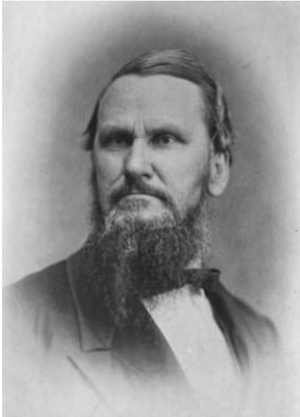
Robert Lewis Dabney

I read the biography of Dorothy Day, (November 8, 1897 – November 29, 1980) an American journalist, social activist, and Catholic convert . (Source: https://en.wikipedia.org/wiki/Dorothy_Day ) I wondered, “Why would anybody who was raised a Protestant be attracted to the Roman Catholic Church to the point of embracing it and its doctrines?” I myself went the opposite direction, from Catholicism to Protestantism. But there have been other famous public figures throughout history who have converted to Catholicism. Examples are former British Prime Minister Tony Blair and former Speaker of the U.S. House of Representatives Newt Gingrich. I did a search and came up with a fantastic document written in the 19th century by Robert Lewis Dabney (March 5, 1820 – January 3, 1898) who was an American Christian theologian, Southern Presbyterian pastor, Confederate States Army chaplain, and architect. He was also chief of staff and biographer to Stonewall Jackson. (Source: https://en.wikipedia.org/wiki/Robert_Lewis_Dabney ) I consider it a highly insightful read that shows how Rome has used carnal attractions to draw others to her.