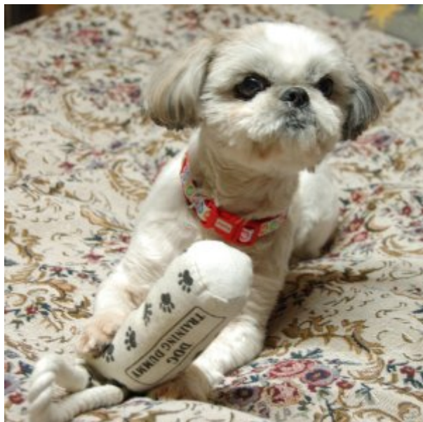
Princess with her toy